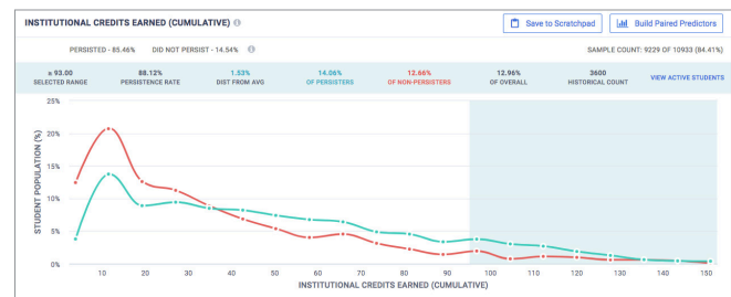
Figure 3: Determining Credit Thresholds and Persisters/Non-Persisters

Note the percent of non-persisters (12.66 percent in the below image). This is the percent of non-persisting students from the historical sample that had earned 75 percent or more of the institutional credits needed for a degree.