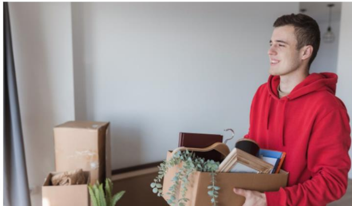
Community college students facing homelessness in Tacoma, Washington were supported by a partnership led by their college and the local housing authority, boosting retention among participants.