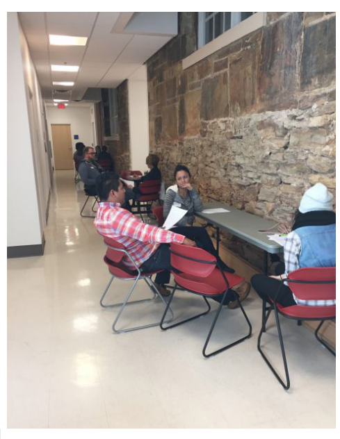
Students discuss what they have learned in a session on soft skills.

"It's not incumbent on the employer to research and understand the skills [our graduates] have," Mallard