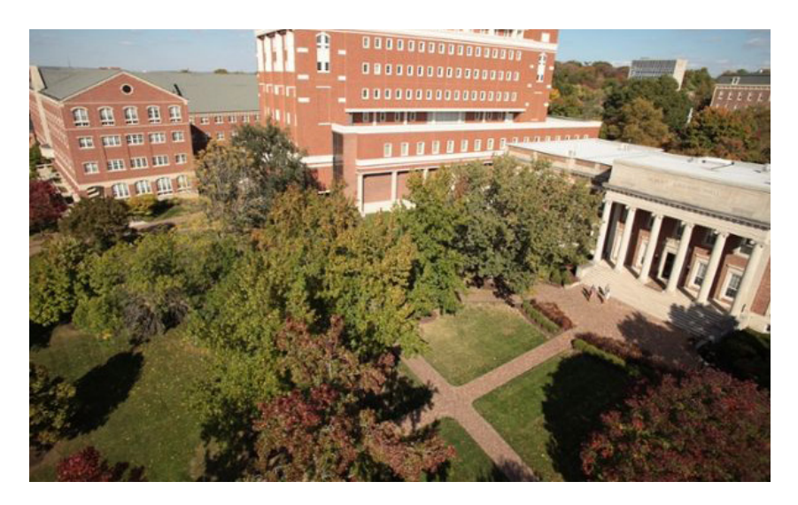
University of Dayton

Those numbers were unveiled at a time when college prices, student borrowing and retention rates are