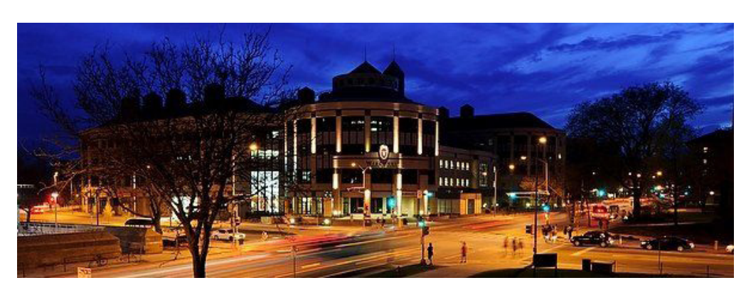
University of Wisconsin School of Business

Many universities try to name their business schools for a single major donor -- they don't leave them unnamed by a group. Wisconsin's announcement also stood out because it came at a time of significant business school naming, a few