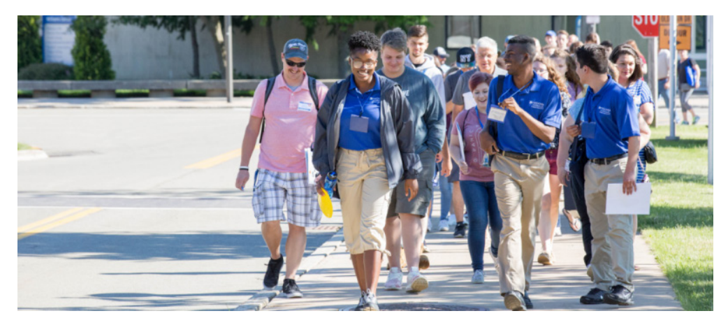
Orientation at Fredonia

So that's what makes this year's freshman class at Fredonia notable. The class is nearly 25 percent larg-