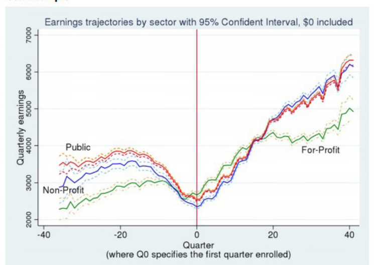
Figure 1: Earnings by Sector of Transfer College Before, During, and After College— CCS-A Sample

One reason for the discrepancy was that the second group was tracked over a shorter period of time. Those students first enrolled in community