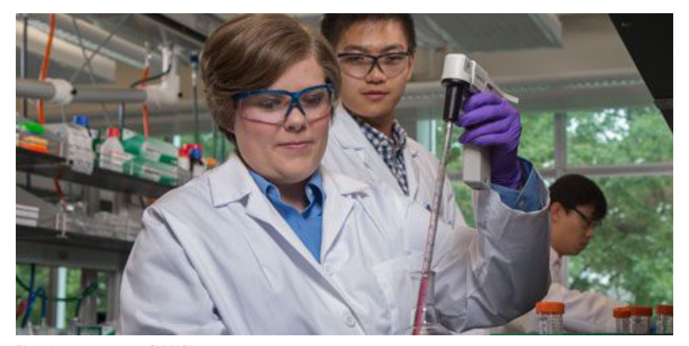
Bioengineering students at SUNY Binghamton

1997 through 2005, the proportion of freshmen planning to enroll in STEM fields declined, hitting a low in 2005 of 20.7 percent. After modest gains in 2006 and 2007, real increases started to show up in 2008.